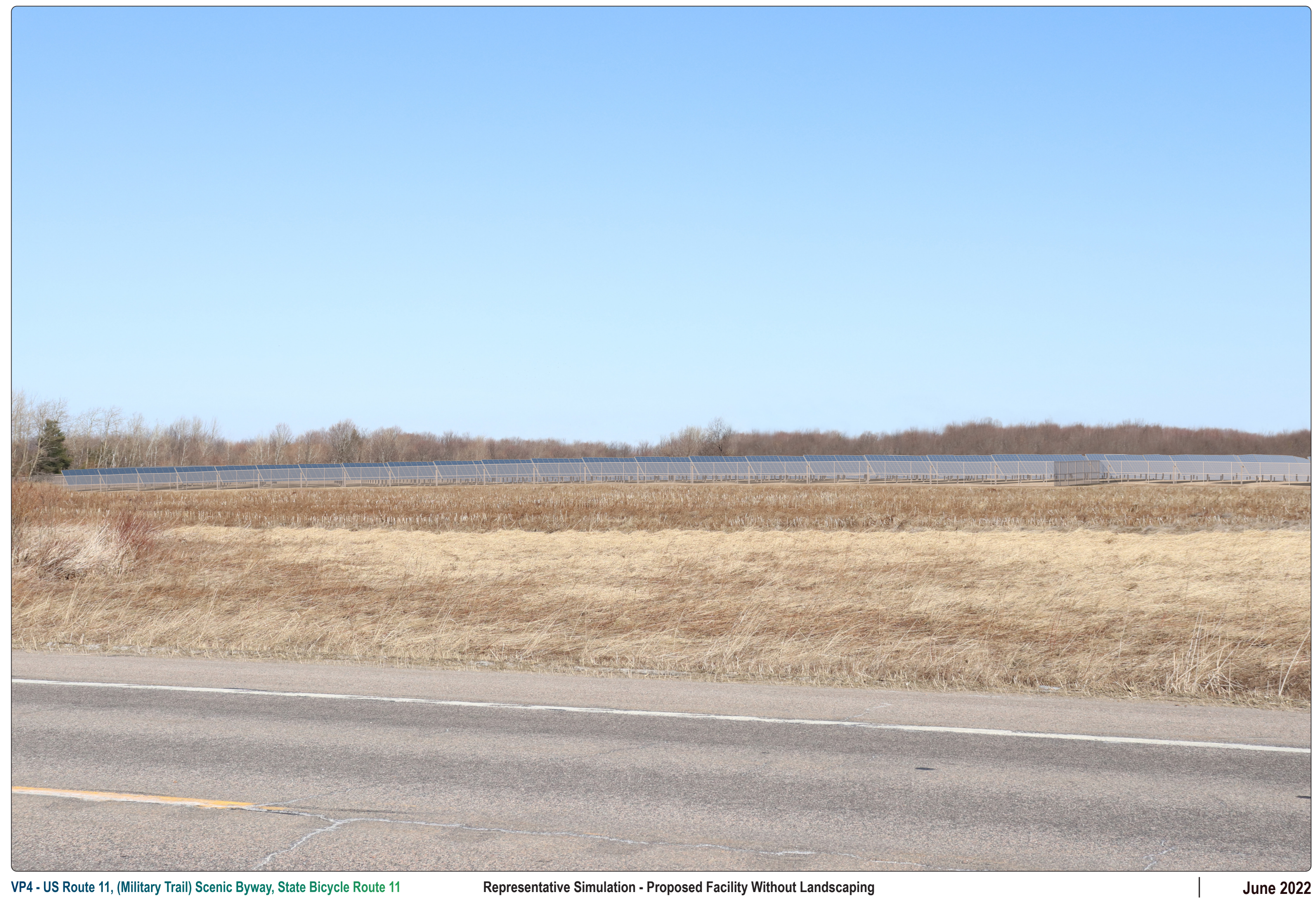
VP4 - US Route 11, (Military Trail) Scenic Byway, State Bicycle Route 11