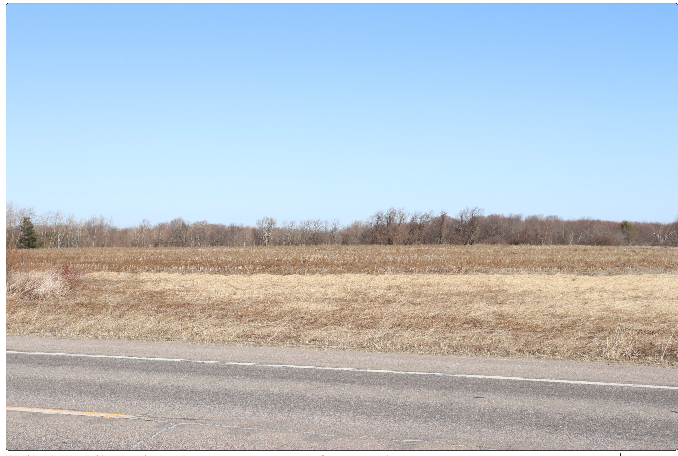
VP4 - US Route 11, (Military Trail) Scenic Byway, State Bicycle Route 11