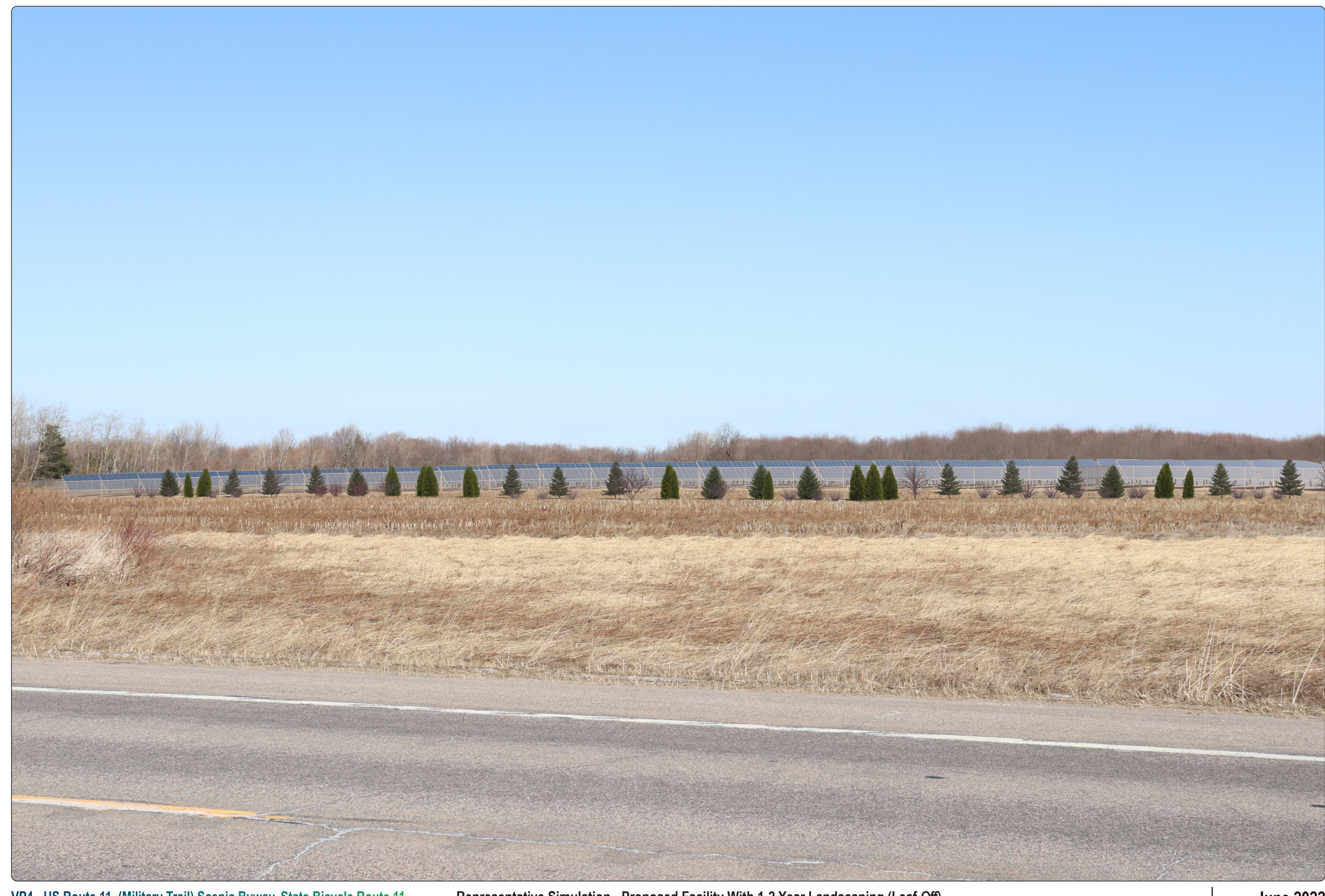
VP4 - US Route 11, (Military Trail) Scenic Byway, State Bicycle Route 11