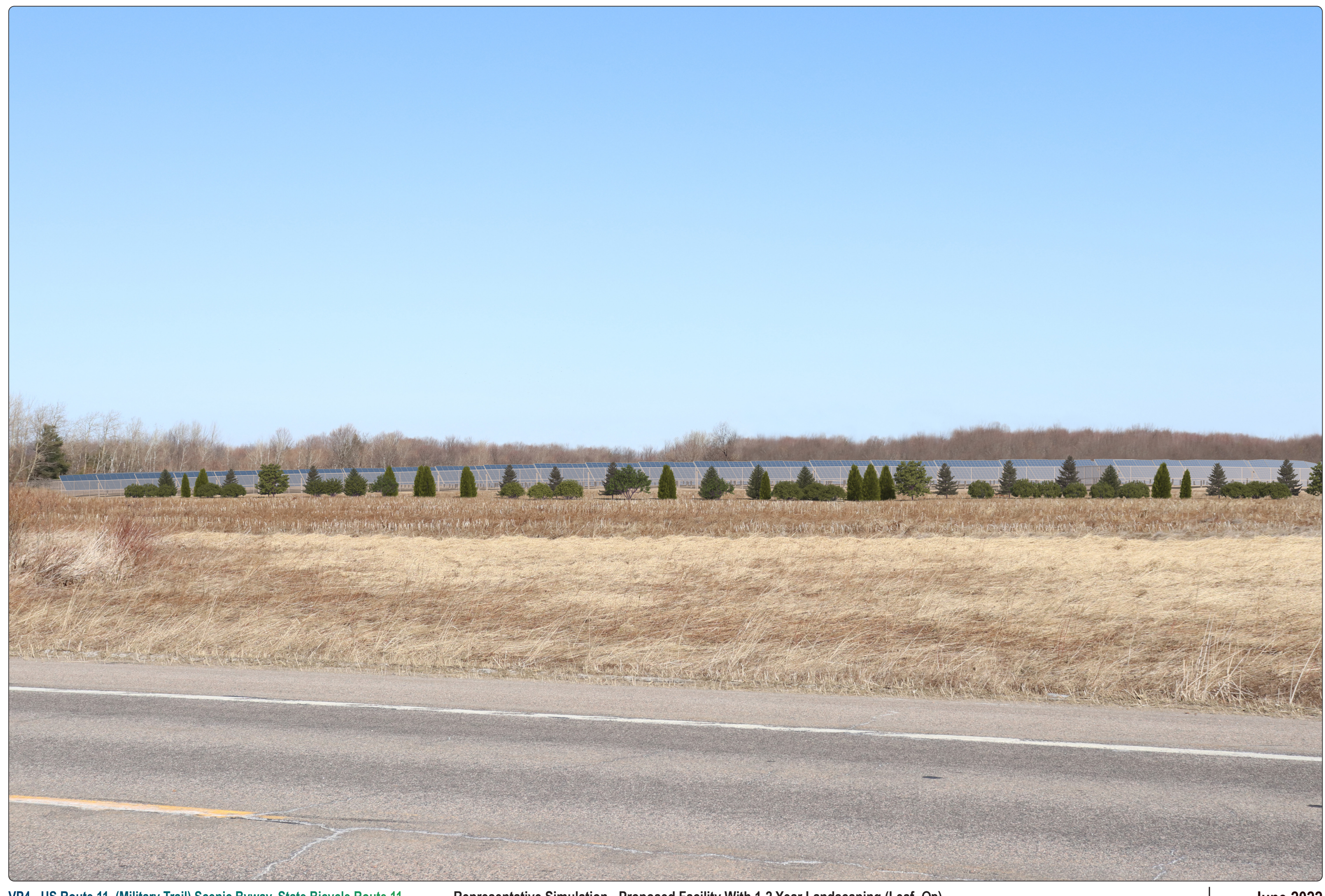
VP4 - US Route 11, (Military Trail) Scenic Byway, State Bicycle Route 11